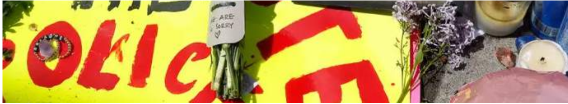
A chain portrait of George Floyd.

On May 25, 2020, George Floyd was arrested on the suspicion that he used a counterfeit $20 bill in Minneapolis, Minnesota. Officer Derek Chauvin said Floyd resisted arrest. Chauvin put his knee on Floyd's neck for eight minutes as Floyd said "I can't breathe." He was unconscious when he was taken to hospital, where he was pronounced dead. Video of the incident went viral.