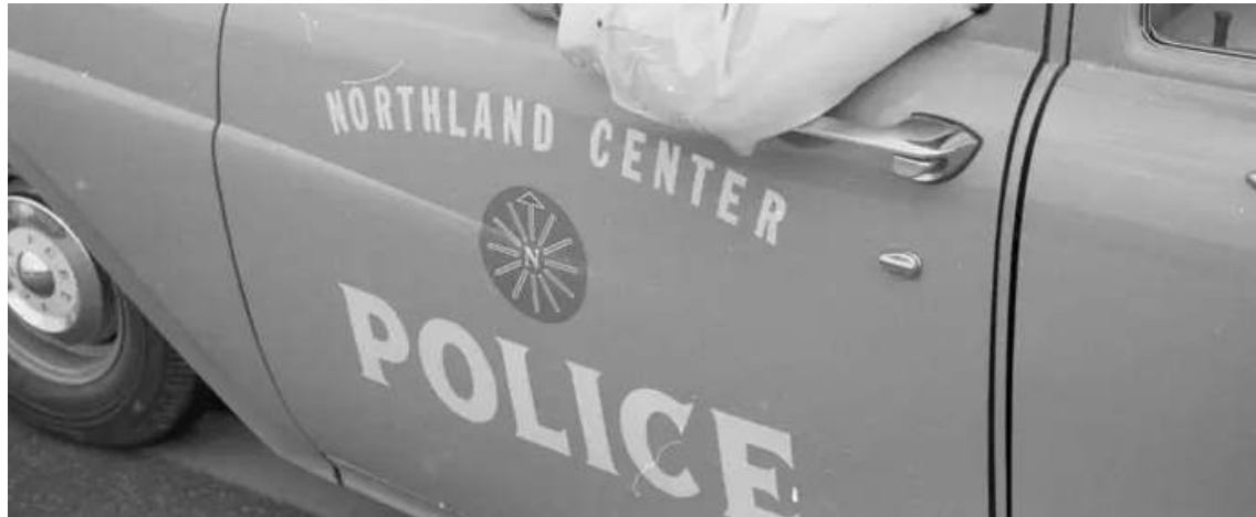
Policeman in his cruiser in the '50s.

Instead of following Vollmer's model, which concentrated on social work and psychology, Hoover made sure local forces were fighting street crimes . Under this new system, police officers were less connected to the neighborhoods they worked in as officers patrolled neighborhoods by car.