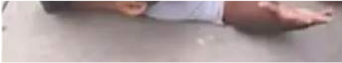
Eric Garner.

On July 17, 2014, New York police officer Daniel Pantaleo attempted to arrest Eric Garner on suspicion of selling illegal cigarettes. The officer put Garner in a chokehold and wrestled him to the ground. Garner said "I can't breathe" 11 times. He was pronounced dead at the hospital. The entire incident was caught on camera, sparking a national outcry. People all over the country highlighted the disproportionate treatment of Black people in the US by the police.