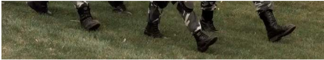
Police at Columbine High School during the 1999 shooting.

On April 20, 1999, two students opened fire at Columbine High School, killing 13 people. At the time, police responded by setting up a perimeter before going after the suspects. The response was widely criticized because of the amount of time the police took before moving into the school.