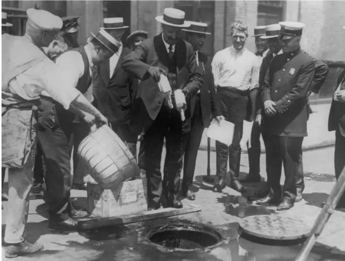
Police emptying alcohol into the sewage drain.

During Prohibition, cops were tasked with stopping the sale and distribution of alcohol. At times, the police would confiscate the