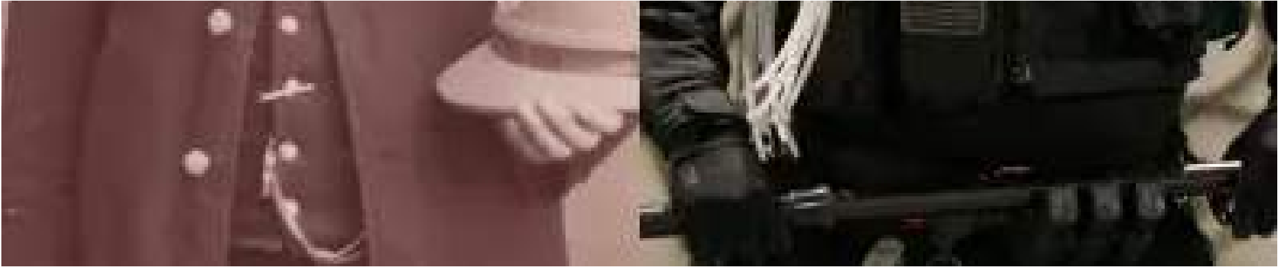
The evolution of a police officer.

The modern police force started in the early 1900s, but its origins date back to the colonies.