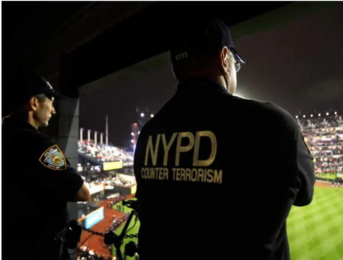
NYPD counter-terrorism.

In 2001, after 9/11, policing changed yet again as departments shifted their focus to counterterrorism.