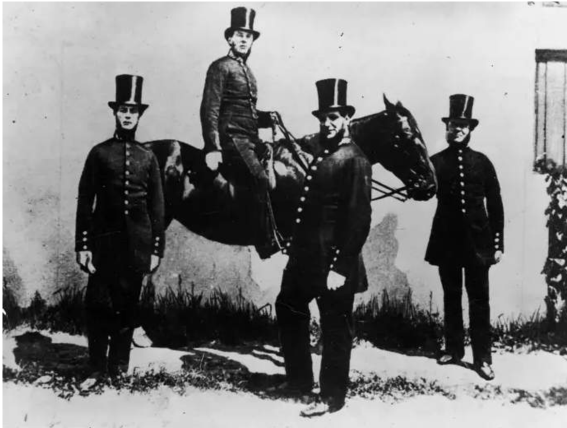
Patrollers in the 1800s.

The history of the police in the South differs from other parts of the country because of the prominence of slavery.