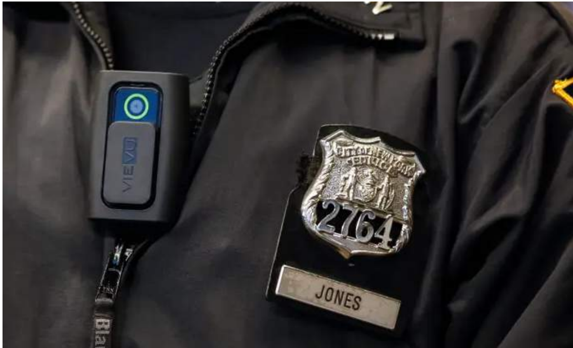
A police body camera.

After the death of Eric Garner and another case the same year — the shooting of Michael Brown — the public called for mandatory body cameras. The hope was that police would reduce racial profiling and could be held accountable for their actions. On the flip side, departments hoped body cams would increase transparency and help solve crimes quicker.