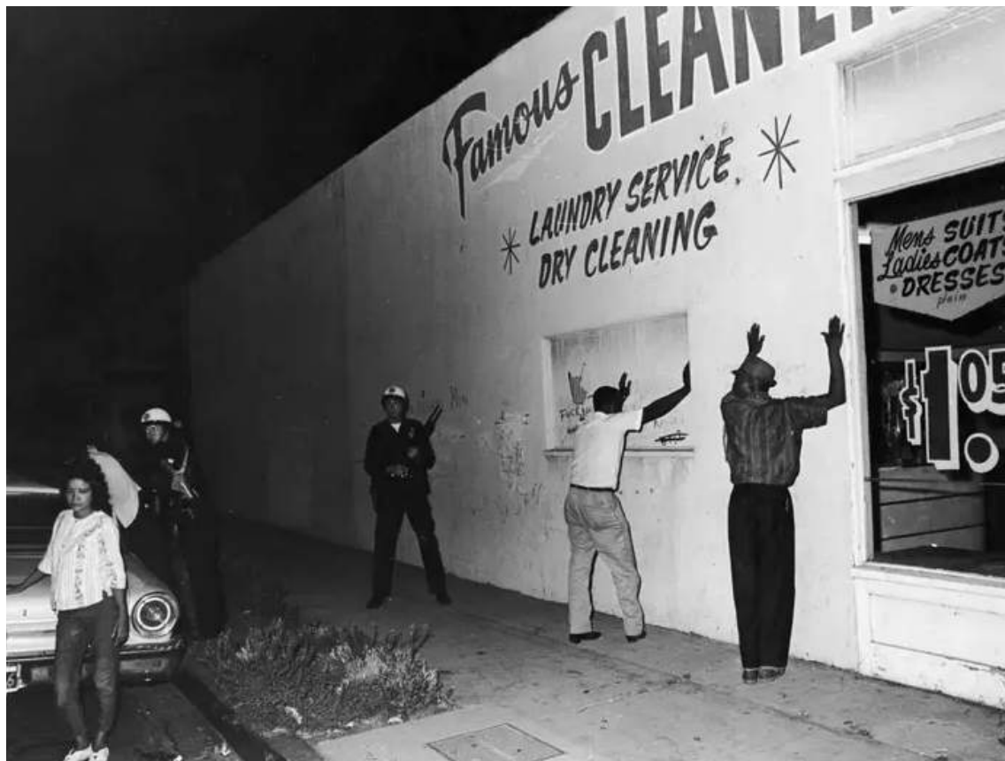
Race riots.