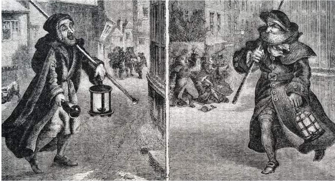
Watchmen in the 1600s.

The night watch was made up of men who volunteered for a night's worth of work . Sometimes people were put on the watch as a form of punishment for committing a crime. These watchmen, however, were known to sleep and drink while on duty.