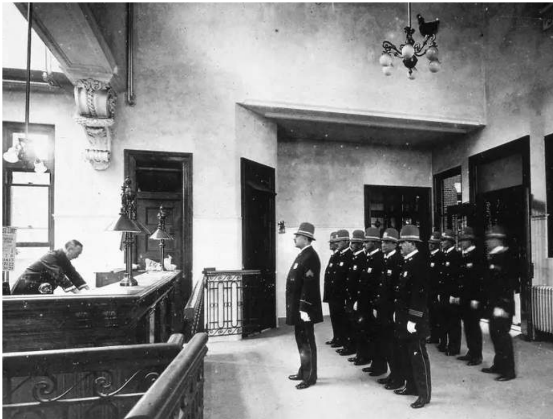
The New York Police Department in the late 1800s.

Almost all of the police forces were structured similarly, and their main duty was to prevent crime and keep order.