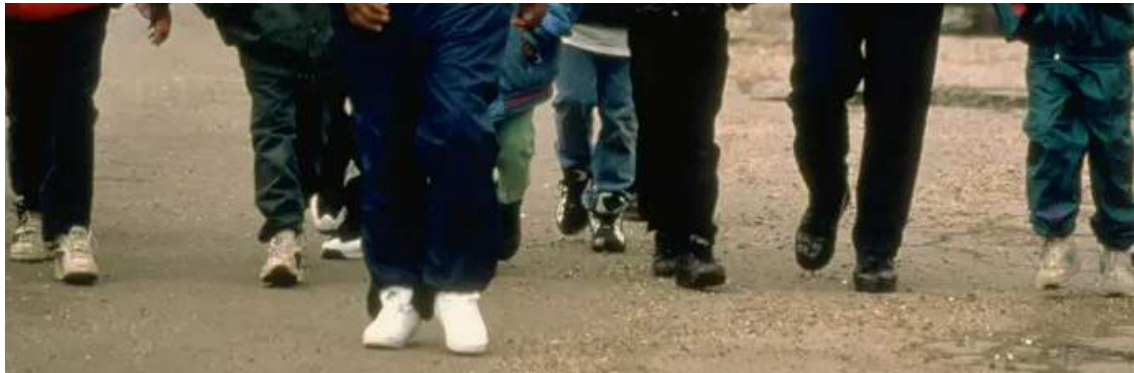
Community policing.

Studies, like in Kansas City, Missouri , found that patrolling police cars in neighborhoods did not help reduce crime, nor did it ease people's fears. In fact, it increased the community's dissatisfaction with police forces .