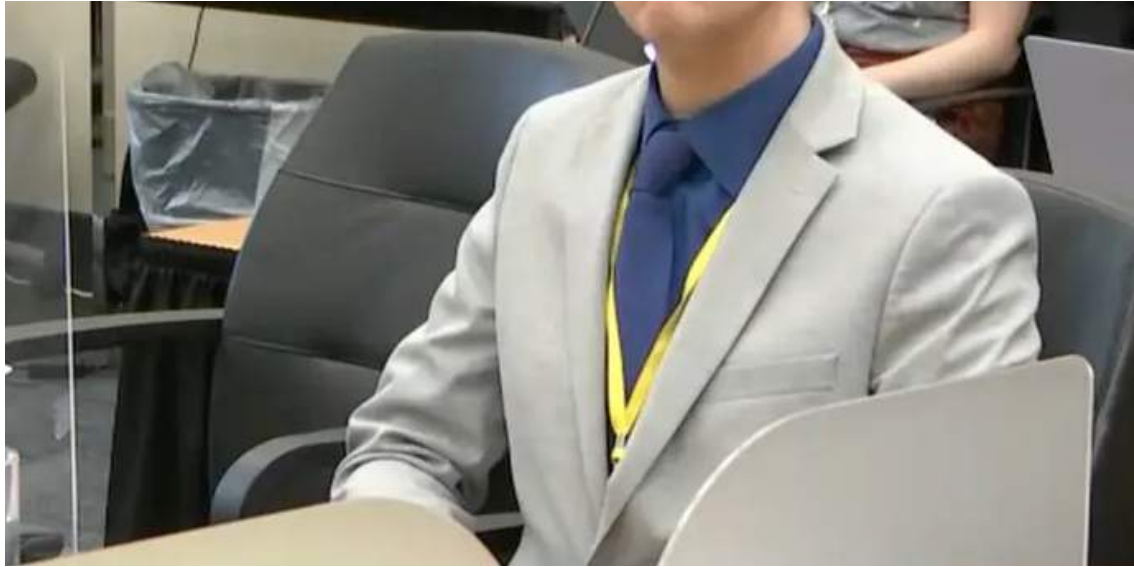
Derek Chauvin watches as his attorney gives his closing argument.

On April 20, 2021, Chauvin was found guilty on all three counts: second-degree murder, third-degree murder, and second-degree manslaughter.