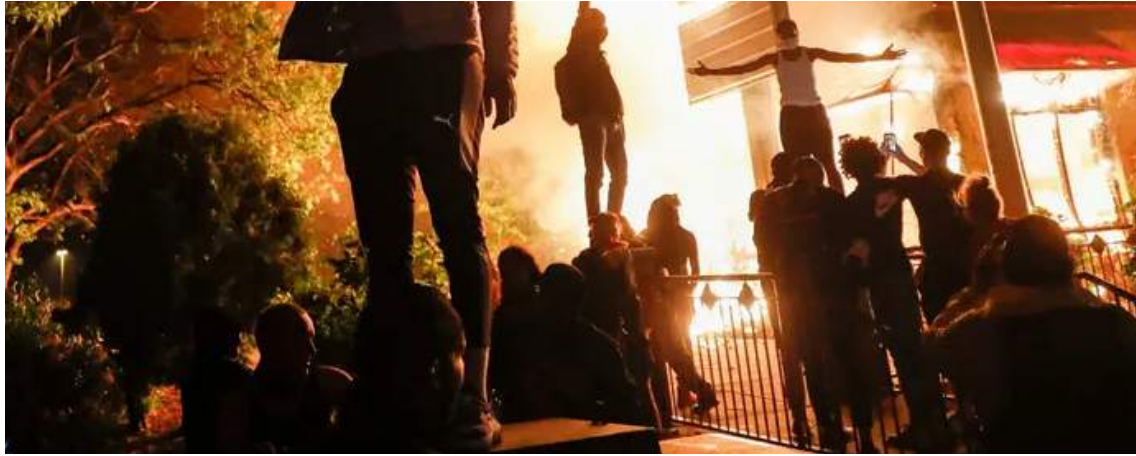
Protesters in Minneapolis.

The protests started in Minnesota, where Floyd was killed, but unrest broke out in cities all over the US . These protests led to arson, looting, and violence. Some police officers responded with tear gas, by running cruisers through crowds , and with riot guns, while others stood in solidarity with the protesters .