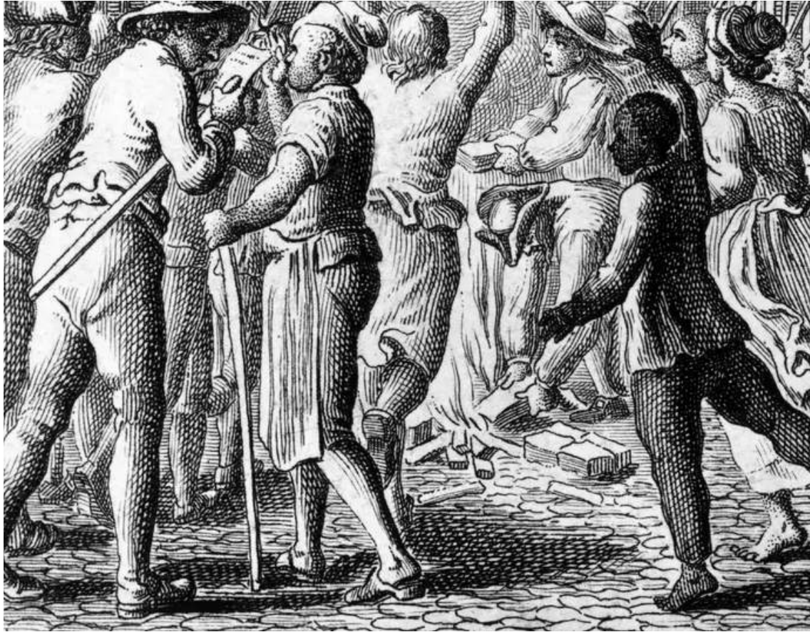
Riot in the colonies.

Immigrants from Germany and Ireland began settling in cities like Boston and New York between 1820 and 1860. This new group of immigrants clashed with original settlers from England and The Netherlands. As the original settlers argued that the new immigrants were ruining American society, crime