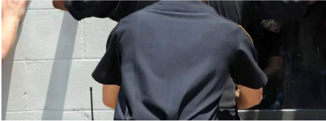
A police officer administering a stop-and-frisk.

"Since September 11, our nation has engaged in a policy of institutionalized racial and ethnic profiling," US Rep. John Conyers said in 2002. "If Dr. Martin Luther King Jr. were alive today ... he would tell us we must not allow the horrific acts of terror our nation has endured to slowly and subversively destroy the foundation of our democracy."